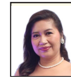
Soci Ame Patagani-Viking Community Service