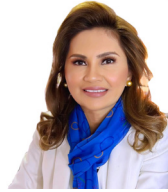
Rozanne 'Twinkle' Cocon-Gamboa Governor, District 3860 Zone 3D